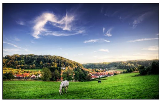
Rissenthal, Saarland, Germany